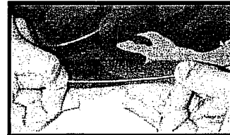
Apply Reinforcement Filament