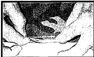
Fold 1 inch Tab Over Filament