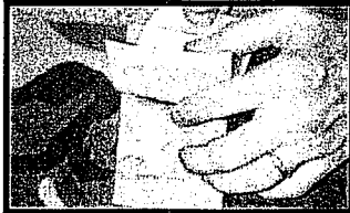
Apply to Back Side