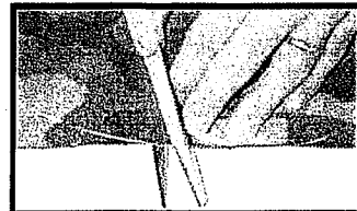
Cut Filament to Width of Patch